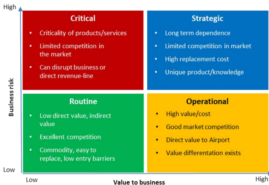
Figure 5.2. Supply base segmentation